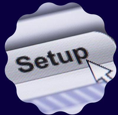
Social Media Setup Tips